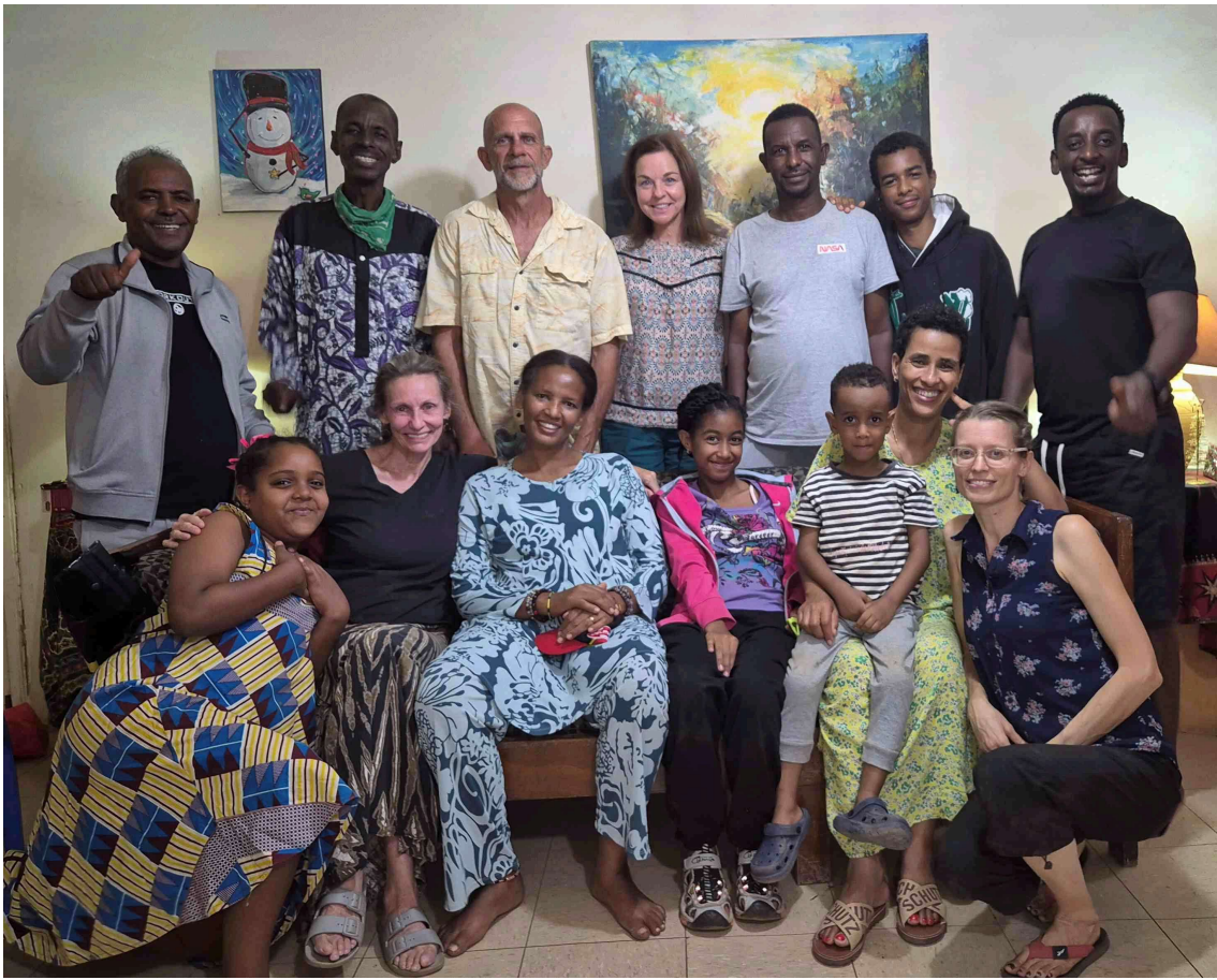
This Christmas we had the absolute privilege of hosting some of our colleagues. They braved the roads with courage (and some flat tires) and arrived in Tumu town. What a celebration!!! Ethiopia, Burkina Faso, Rwanda, USA & Canada in Ghana celebrating Jesus.