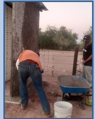
Starting with the basics – Building the bathroom.

The Bible school (CEC) is moving full steam ahead for startup in January. By faith we will finish all 14 weeks this year. Please be praying with us. We also have more students that want to come which has never happened this early in the year. Normally we don't know how many we will have till the day before classes begin so we are very much encouraged.