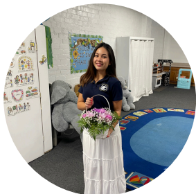
Super smiles in TK!