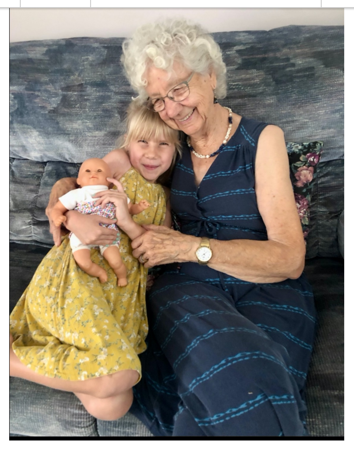
Copyright © *2019*, All rights reserved.