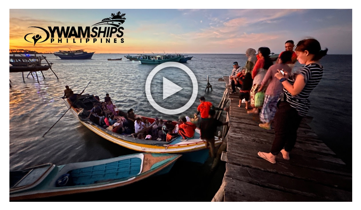
Mangsee Island, West Philippine Sea - Volunteer doctors and dentists clamber into a water taxi with other YWAM staff to ferry back to the MRRV Cabra, a larger patrol boat of the Philippine National Coast Guard.

This is a love story about going the extra mile to show the people of Balabac and Mangsee islands that they are loved - with no strings attached. Behind these difficult outreaches, lies the hope that in demonstrating love for one another, others will become hungry to know more about the change of heart from which we live; that is, Jesus.